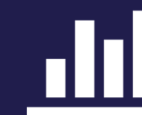
Reporting & Analytics