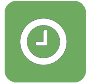
HR Help Desk Ticketing