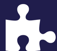
Data Connectivity & Integration