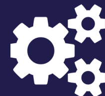
Automation & Rules