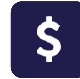
Retirement/ Benefits Tracking